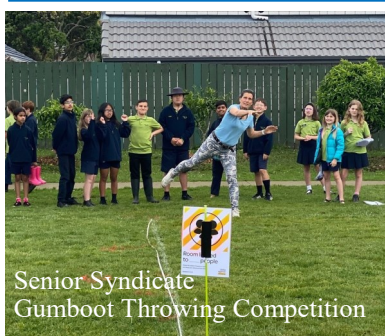
Senior Syndicate Gumboot Throwing Competition