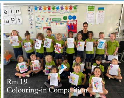
Rm 19 Colouring-in Competition