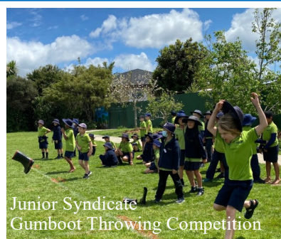
Junior Syndicate Gumboot Throwing Competition